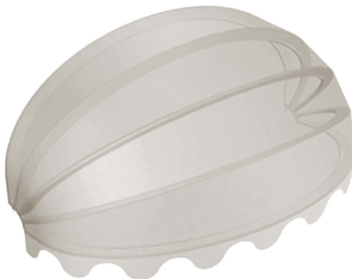
Ovale . Oval

Opening and closing cable awning, ideal for shops and for windows.