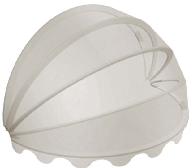
Sferica . Spherical

Tende con richiamo a fune, particolarmente indicate per esercizi commerciali ed in genere vetrine e finestre. Struttura verniciata con polveri poliestere presso il nostro stabilimento seguendo rigidi standard qualitativi. Struttura con telaio in lega estrusa e articolazioni in resina termoplastica.